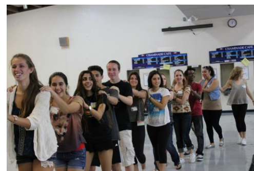
It's Conga Time!

See the highlights, attendee reactions and other powerful talks from the MNMS 2013 Leadership Day please visit the My Name My Story YouTube Channel