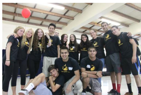
MNMS@NADE Leaders lead the entire event. These leaders tirelessly sacrificed their time to spread the word of Empathy & Unity in the community. MNMS@NADE Leaders - YOU GUYS ROCK!

For more information on how you can create an impact in your school and community visit: